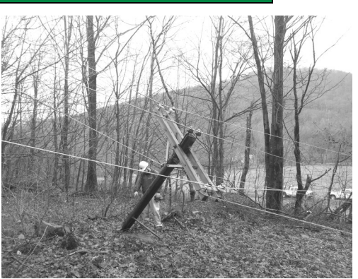
DCEC Lineman, Steve Little, stands next to a broken pole near the Andes substation.

Effects of Hurricane Sandy hit DCEC electric lines on the evening of October 29th. At one point we had 1,150 members without electric service, and all were restored by early evening on October 30th. Numerous trees had fallen creat-