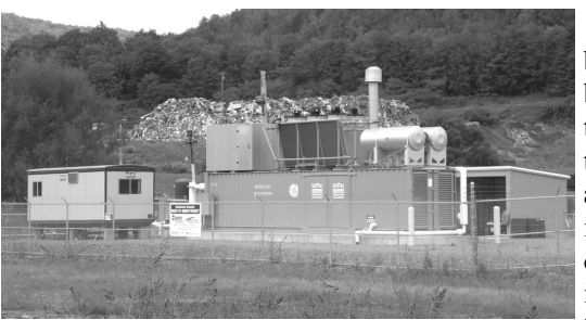
Delaware County Waste-to-Energy Project