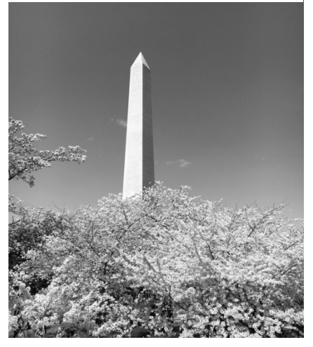
Washington Monument pictured with cherry blossoms